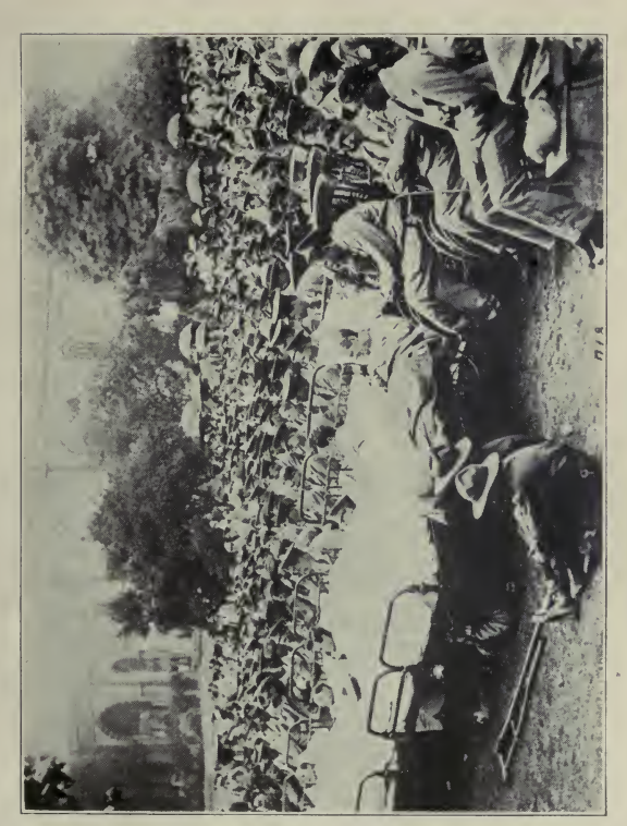
AN AUDIENCE OF SERIOUSLY WOUNDED