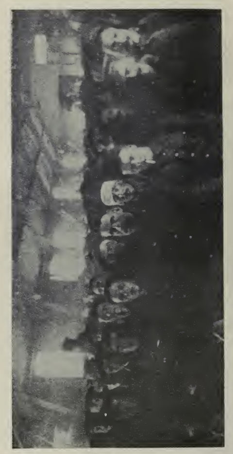
AN AUDIENCE OF CONVALESCENTS BEHIND THE LINES